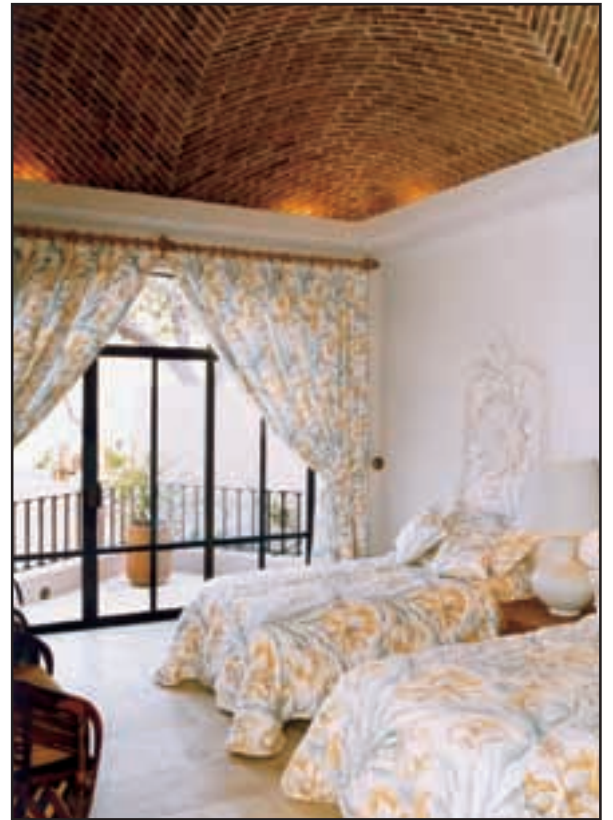
typical guest room